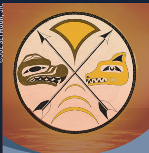
STORIES FROM THE WARRIOR SOCIETY SATURDAY JAN 24 7:00PM