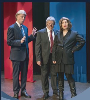
THE CAPITOL FOOLS THURSDAY OCT 9 7:30PM