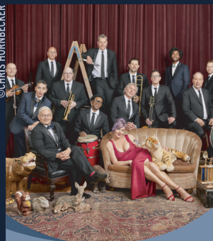
PINK MARTINI SATURDAY JAN 31 7:30PM