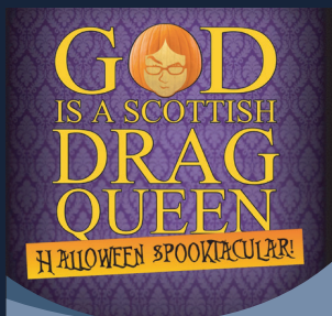
GOD IS A SCOTTISH DRAG QUEEN HALLOWEEN SPOOKTACULAR FRIDAY OCT 17 7:30PM