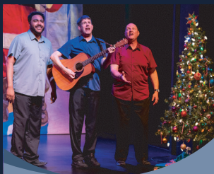
REDUCED SHAKESPEARE COMPANY'S THE ULTIMATE CHRISTMAS SHOW (ABRIDGED) THURSDAY DEC 4 7:00PM